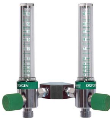
Dual Flowmeter Assembly