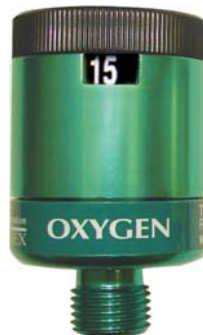
Oxygen Dial Flowmeter