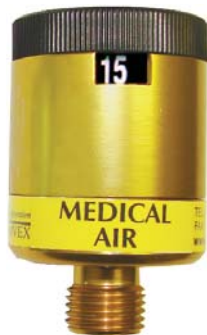
Medical Air Dial Flowmeter